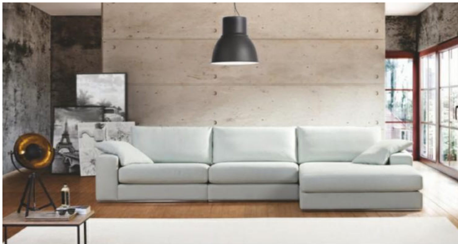
Alberta 1 MAX PL-1 MAX AL-D MAX R