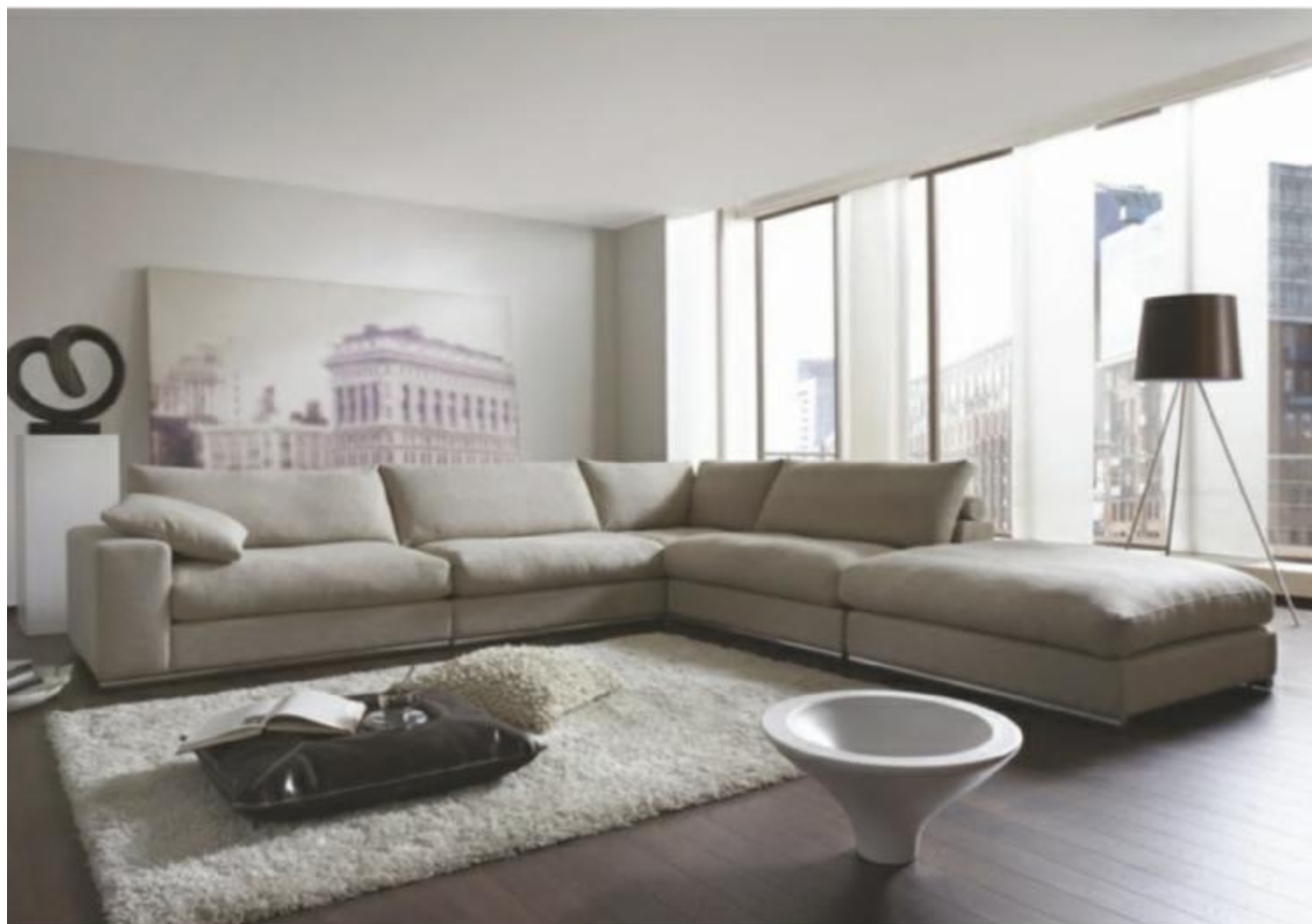
Alberta corner group 1,5 PL-1,5 AL-C-1,5 AL-stool