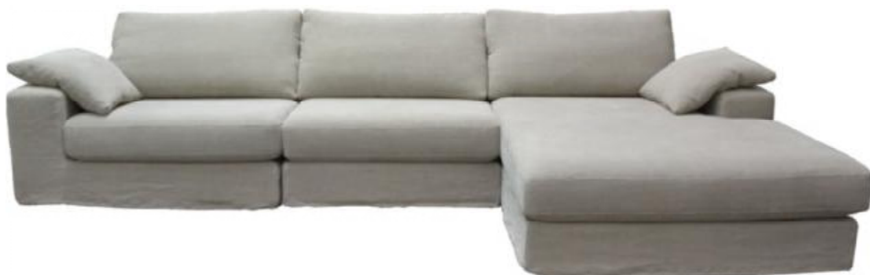
Alberta 1 MAX PL-1 MAX AL-D MAX R L.C.